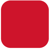
Pantone 186 C